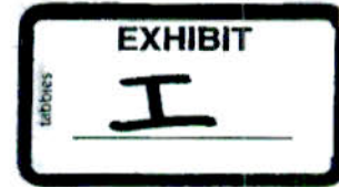
Exhibit I to CS-68-18

Condition of Appropriation means a condition placed on an appropriation or expenditure by the Navajo Nation Council at the time the appropriation or expenditure is made, which requires performance of a specific task by a program within a specific time period within the fiscal year. The condition requires the performance of specific tasks within the time period set out by the Navajo Nation Council. Failure to perform within the specified time period may result in restrictions on future expenditure of the funds until the condition is met. 12 N.N.C. §810(I), Amended by CS-52-17